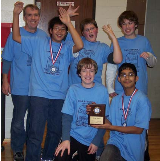
One of PIP's Robotics Competition Teams wins The Technology Award and a Spot at the State Championships!

This 1 Hour Relay Race will run on 2 Reserved Tracks to Introduce the Thrill of Formula 1 Indoor Cart Racing to our Guests! All Racing levels include a 30 minute Driver Training Class, Free Admission for Drivers Only, 5 Discounted Guest Tickets at $25 each (must be purchased by March 17 th ) , Team Name in our Program Book and Raffle Tickets to Win 2 Red Sox Opening Day Game Tickets with free Parking!